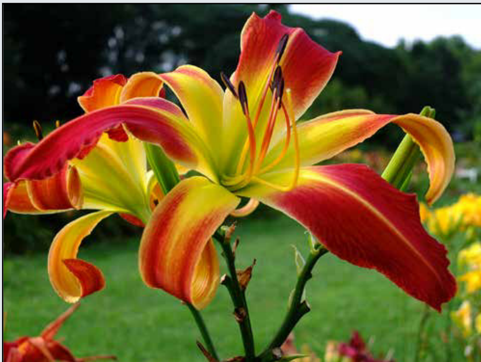
#23- 'Hurricane Bob' (Schwarz, B. 2003)