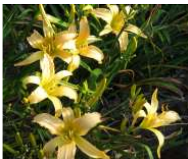
'Suzy Cream Cheese' (Bachman, 2001) and 'Lady Barbara' (Culver-B, 2015)