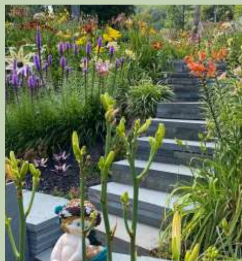
Weller Garden in 2022

My grandmother used to say, "Faint heart never won fair maiden." A half-hearted approach to amending garden soil may well mean that the garden does not have a "Happily Ever After."