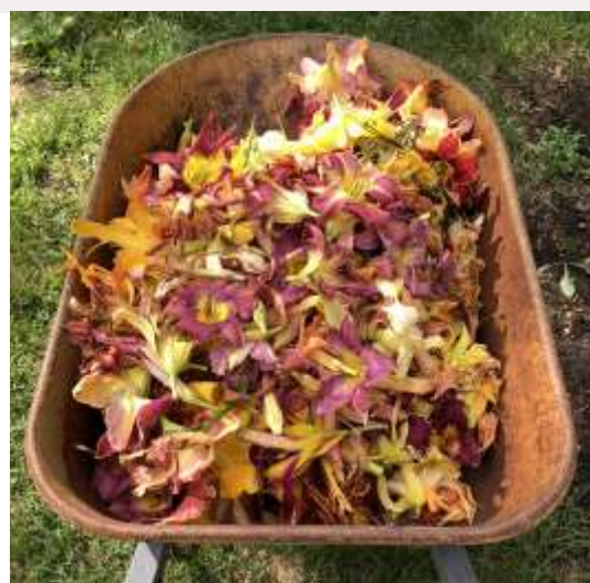
(left) Harmon Hill Farm live-heading in progress; (right) The end result