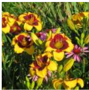
'Fooled Me' (Reilly-Hein, 1990) and 'Sun Panda' (Culver-B, 2009)