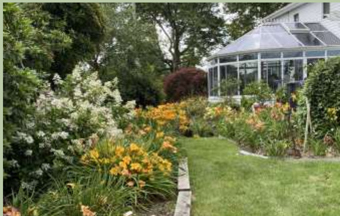
Weeping Blue Atlas Cedar and Paul Limmer's Garden in East Northport, NY