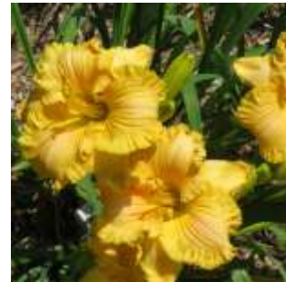
'Priscilla's Dream' (Shooter, 1993) and 'America's Most Wanted' (Carr, 1997)