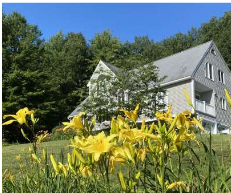
(left) Dave Mussar in Stern Garden; (right) Stern garden