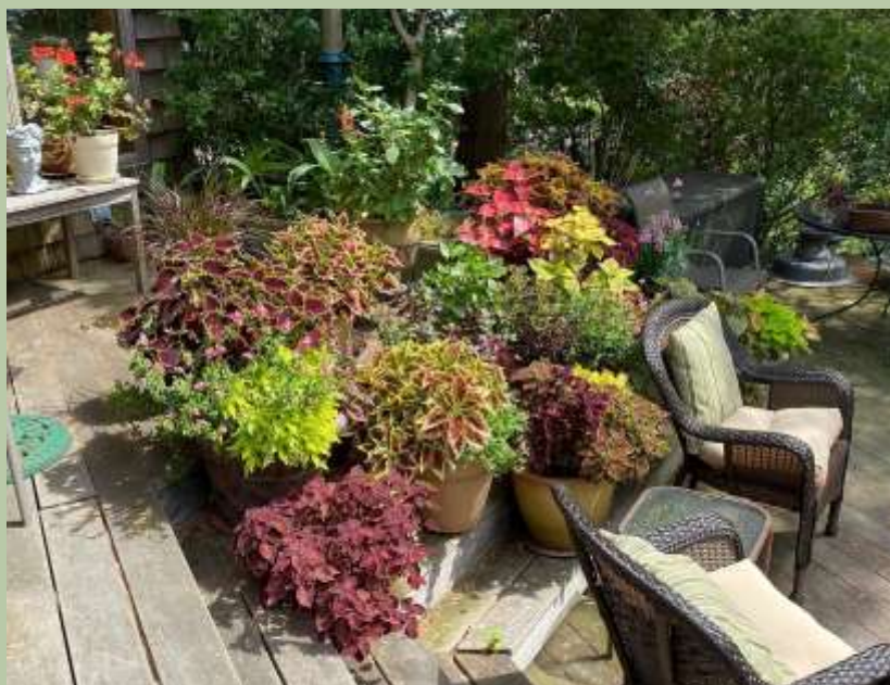
Cat exploring back deck and coleus in pots at Petersen's Garden in Asharoken, NY

Finally, after a drive through a torrential downpour from a cloud that seemingly tracked only our car, we arrived at the familiar, serene, and always amazing garden of Chris Petersen. Although unfortunately the deer had gone to town on her tasty daylilies, a sad but common theme with frequent showers washing away deer repellent this year, there was plenty of beautiful plant-life to enjoy (and beach cacti to escape) on the scenic shores of the Long Island Sound in Asharoken, NY. From the meandering, verdant beds to the robust plants in clustered pots on the decks (including the new deck recently built by her talented carpenter husband), there is always something in bloom in Chris's garden. Ever generous, Chris shared cuttings of her many (many!) varieties of my (second) favorite plant, coleus, as well as several other plants. I am grateful we made this final stop, as sadly our annual LIDS BBQ here was relocated due to rain.