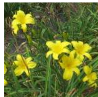
'Hazel's Gift' (Valente, 1992) and 'Yellow Pinwheel' (Stevens-D, 1978)