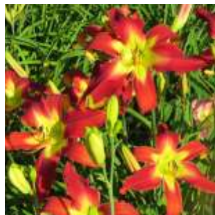
'White Eyes Pink Dragon' (Gossard, 2006) and 'Megatron' (Gossard, 2006)