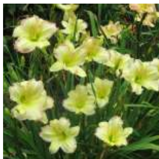
'Hudson Valley' (Peck, 1971) and 'Beautiful Edgings' (Copenhaver, 1989)