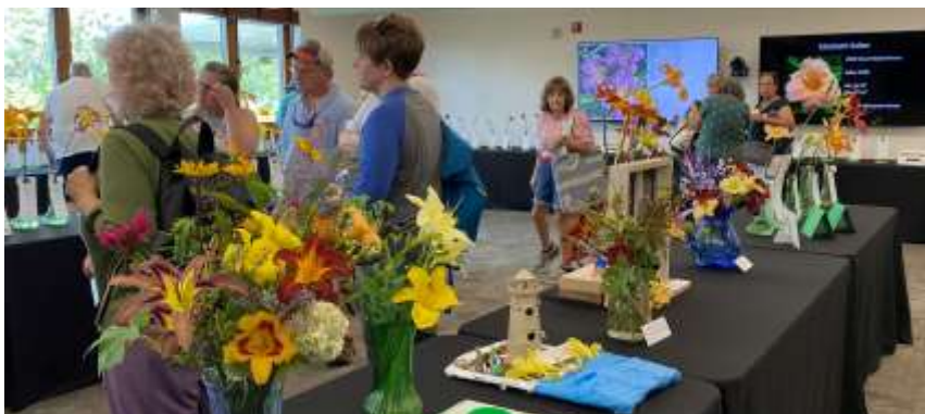
(left) Display at the Exhibition; (right) Visitors in the Exhibition